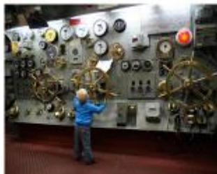
The panca indera adalah "command center" kita

Copyright 2016 © International Christian Chamber of Commerce