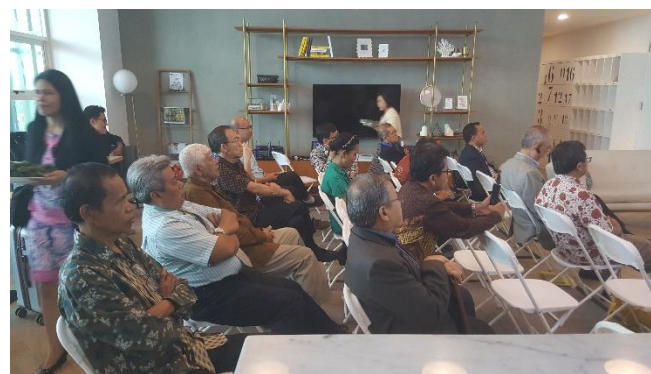
Nampak peserta sedang menyimak dengan antusias